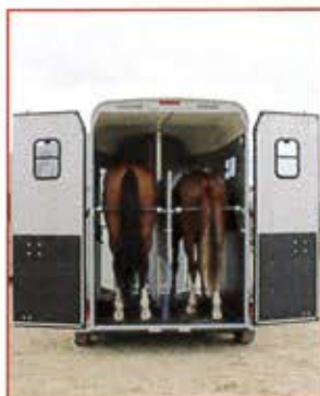
EXTRA Rear double doors