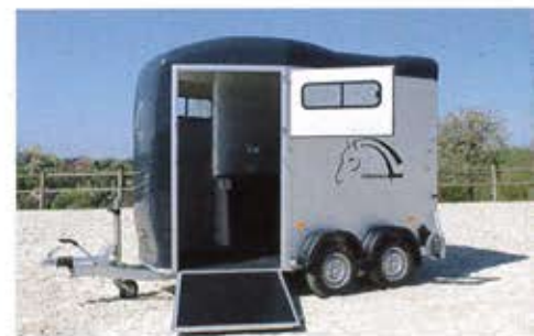
Large front unloading ramp